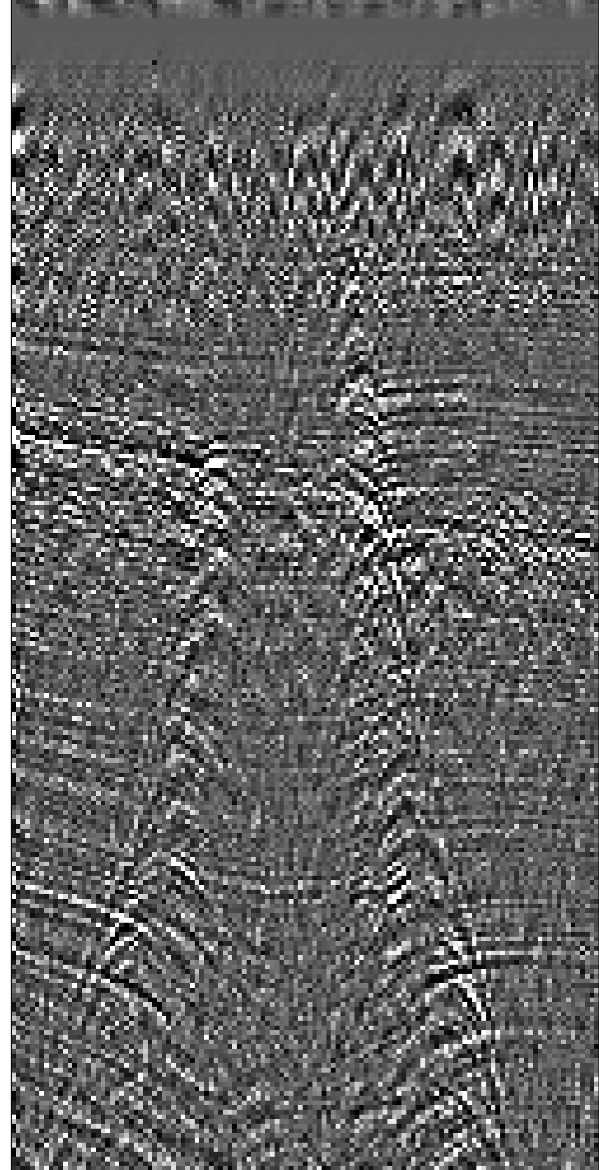
TI * PEF