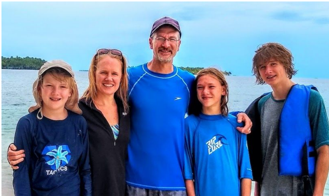
Powers family in Panama