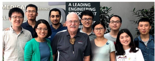
Singapore University Singapore students.